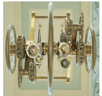
View from directly underneath clock