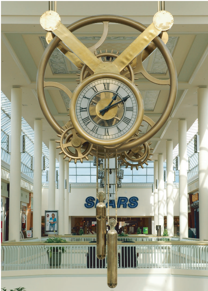
This unique timepiece stands 12' tall and weighs 6,000 lbs.

Highlights - The clock is 12' tall and weighs 6,000 lbs. The intricate series of gears, cogs, counterweights and drive movements, is a constant source of entertainment. This unique timepiece sounds a Westminster chime every quarter hour.