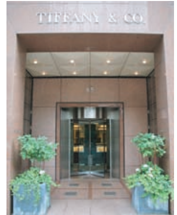
Entrance with security doors open

Highlights - The stainless steel security doors are etched with a brushed finish and accented with rosettes.