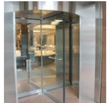
Entrance showing pocket door in hidden position