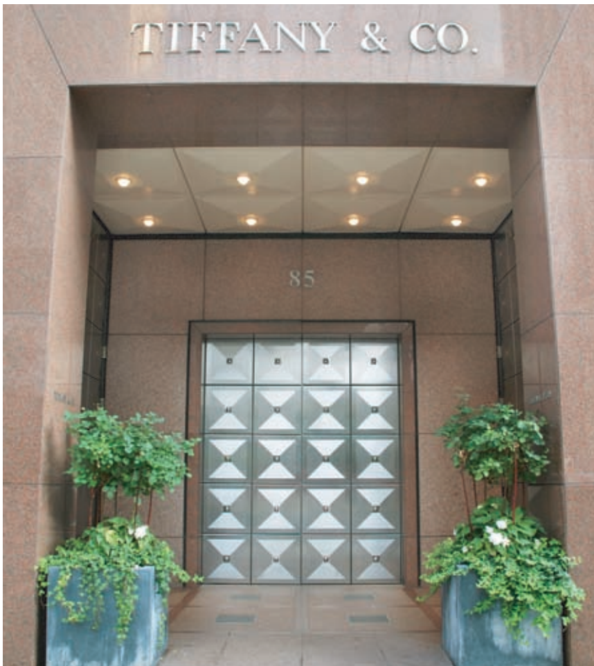
Entrance with security doors closed