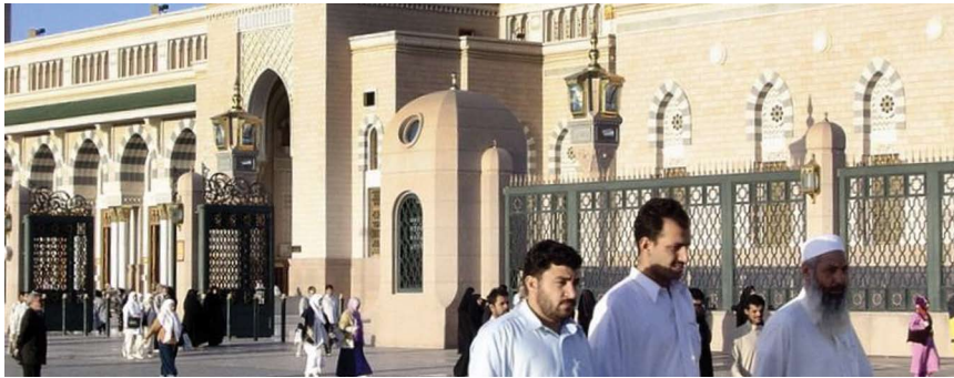
The completed fences and gates at the entrance to The Prophet's Mosque.