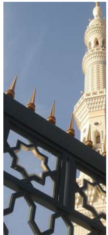
Detail of the bronze inlays and painted finials