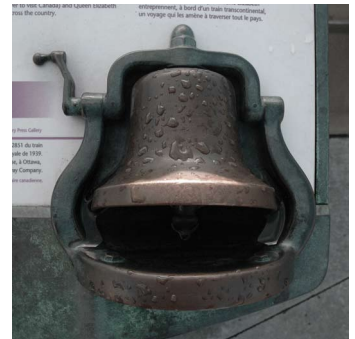
An exquisitely rendered miniature bell