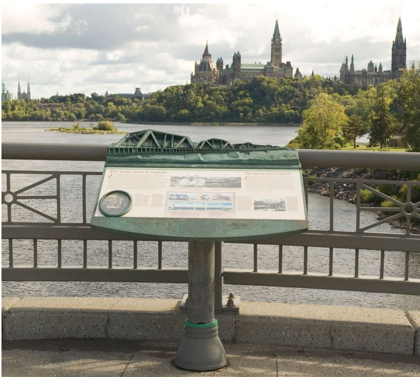
One of the (10) original Confederation Boulevard plaques overlooking the Ottawa river and Parliament buildings of Canada