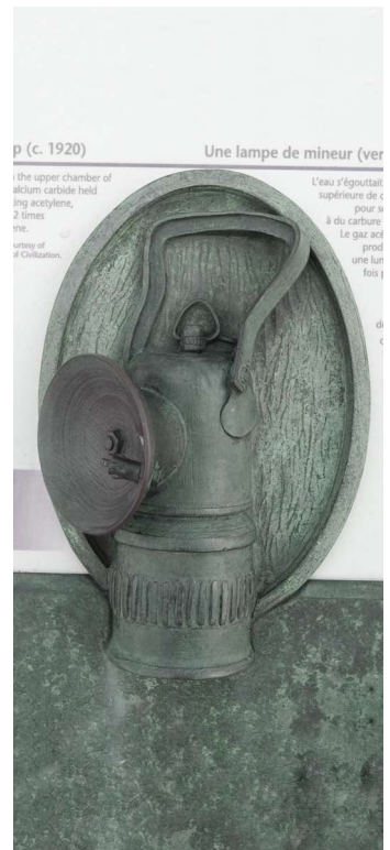
Highly detailed cast artifacts adorn these plaques