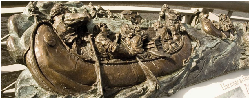
Detail of the sculpted and cast artwork atop one of the (10) original Confederation Boulevard plaques