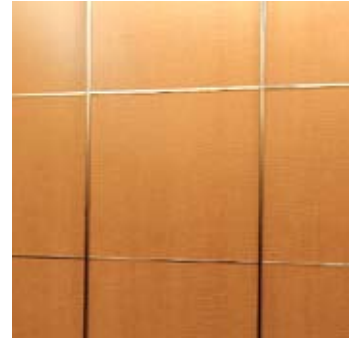
Anigre veneer panels and stainless steel trim

Highlights - These elevator cabs feature anigre veneer paneling with stainless steel trim. Handrails are solid wood and the ceiling is painted aluminum formed in an undulating shape to match the main lobby ceilings of the building. Floor is lightweight, thin cut granite. Etched mirrors are featured in the rear corners of the cab with a large rectangular slab of etched and sandblasted glass complementing the rear wall of the cab.