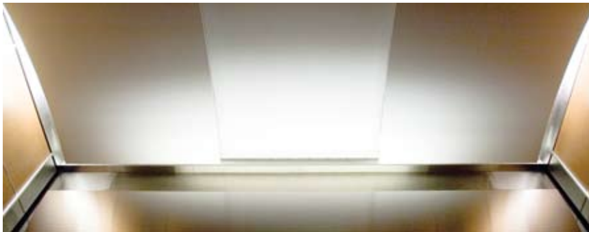
Painted aluminum ceiling carries the undulating design from the lobby into the elevator cabs