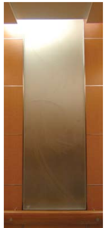
Etched and sandblasted glass feature