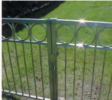
Stainless steel gate