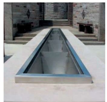
Stainless steel planters