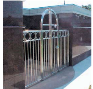
Stainless steel gate