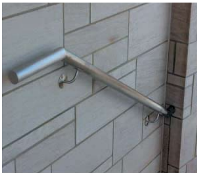
Stainless steel handrail