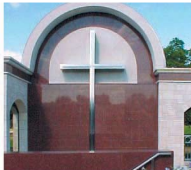
Inner stainless steel crucifix