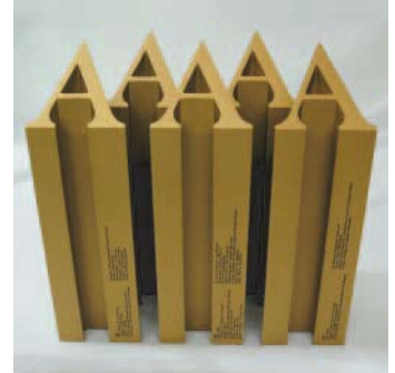
A group of awards

Highlights - The award (better known as the 'A-Award') is made of extruded aluminum and is finished with an attractive matte metallic acrylic polyurethane paint. When cut on a specific angle, the extrusion yields a perfectly rendered Times New Roman 'A'. The club's name is engraved, while the recipient's name is screen printed in black.