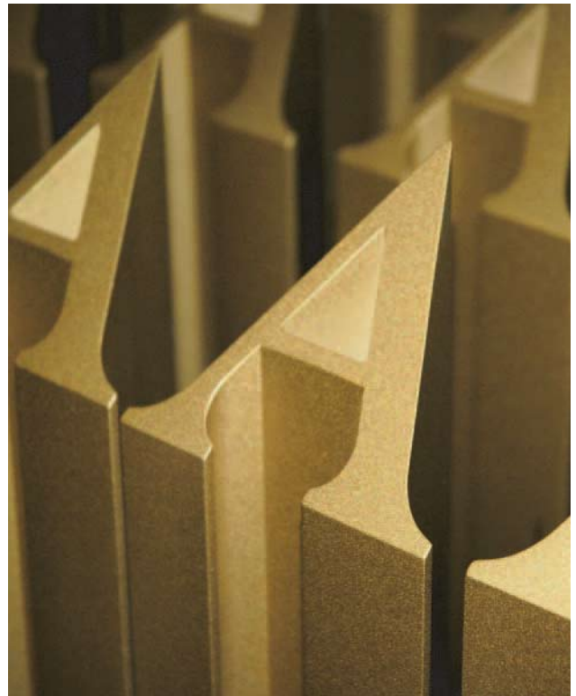
Matte metallic finish