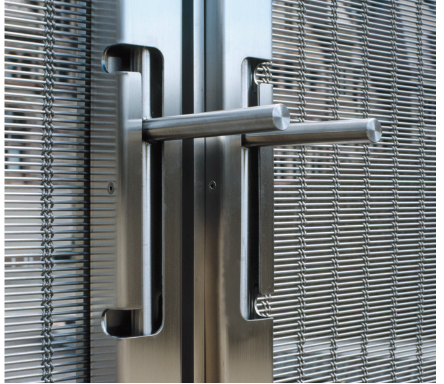
Down-bolts on south ramp gates