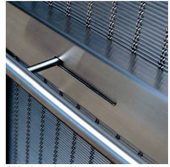
Sliding latch assembly