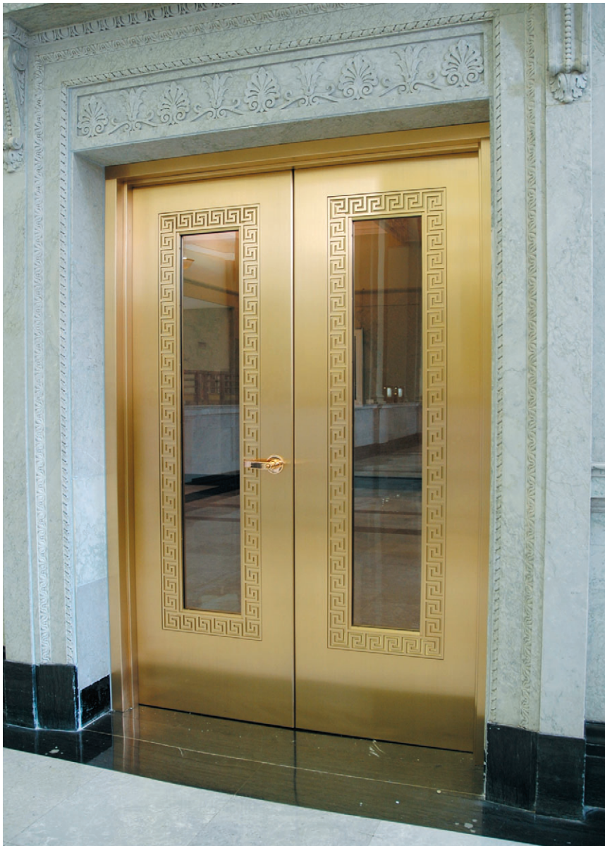
Steel-framed, bronze-clad doors with glass panels