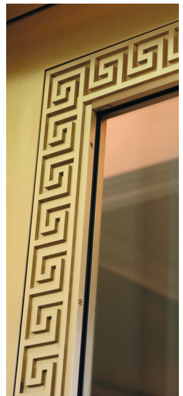
Professionally installed glazing