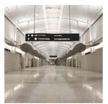
Individual tubes create undulating form