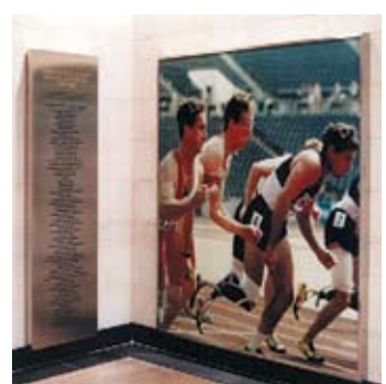
Stainless steel plaque and mural