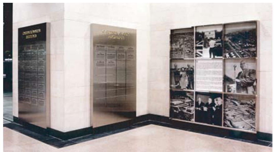
(2) brushed stainless steel plaques (left) and acrylic finished photography mural (right)

Highlights - All pieces are made of stainless steel with bronze accents. Plaques feature waterjet cut and pinned mounted lettering and etched text. Photos are sealed with clear matte acrylic. Pyramid shaped statue display features polished black granite and top hat illumination.