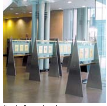
Freestanding members plaques