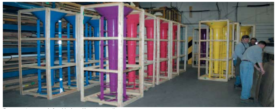
Downspouts are ready for shipping with custom crating

Highlights - Each 2.3 meter tall structure was fabricated from (2) seamlessly welded spun aluminum cones and features (5) waterjet cut rings - designed for asthetics and supprt. The structures are powder coated in traditional Barbados' colours.