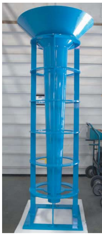
Individual water downspout