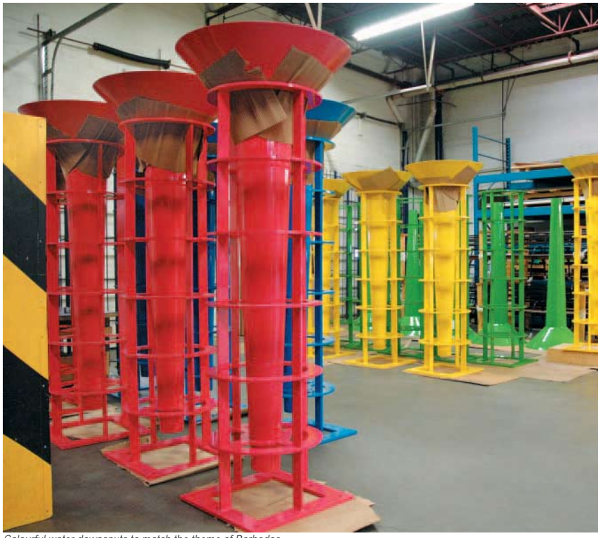
Colourful water downsputs to match the theme of Barbados