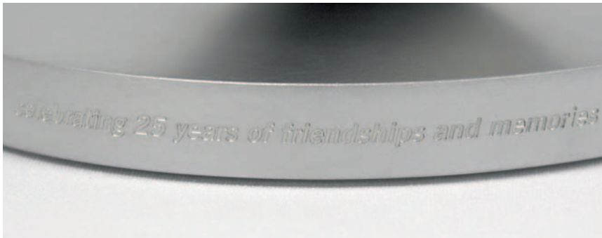
CNC machined graphics