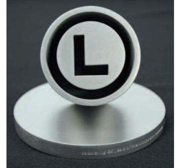
Precisely set elements

Highlights - The award is made of stainless steel with an orbital brushed finish. The body column features a waterjet cut circular disc and "L" shape centered within the column and CNC engraved graphics on the curved side face. The base is a 3/4" thick circular disc also with CNC engraved graphics. Project turn around time was less than one month.