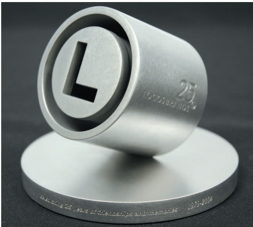
Logosbrands 25th anniversary award made of st. stl. with orbital brushed finish and CNC machined graphics