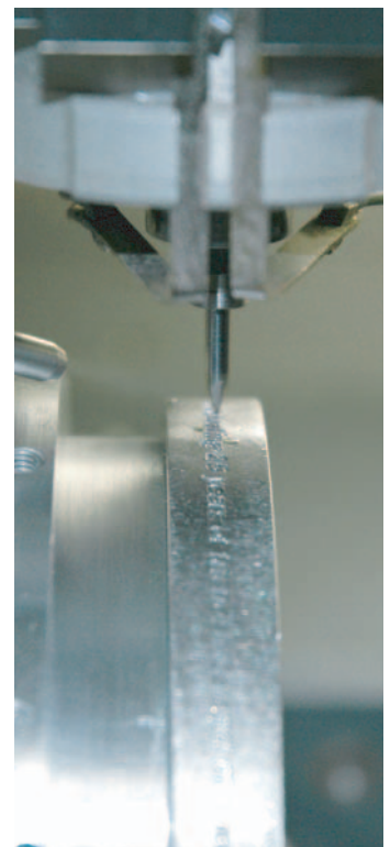
Live photo of CNC machining system on curved surface