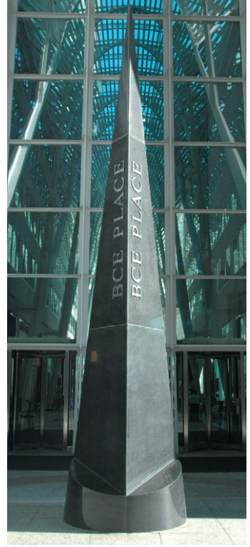
St. stl. letters pinned mounted on granite obelisk