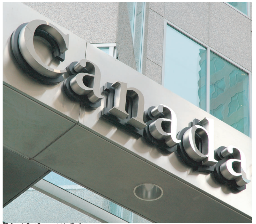
TD Canada Trust Tower main identification

Garden court precision welded st. stl. channel letters