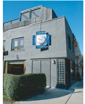
St. stl. exterior clock sign is angle mounted to maximize visibility

Highlights - The clock features non-directional brushed st. stl., with polished st. stl. clock markings. The clock face is accented with 3 ft. long, red clock hands, and a white faceplate ring. The banners are made with blue, weather resistant, vinyl with yellow text. The clock is angled from the building wall to maximize visibility.