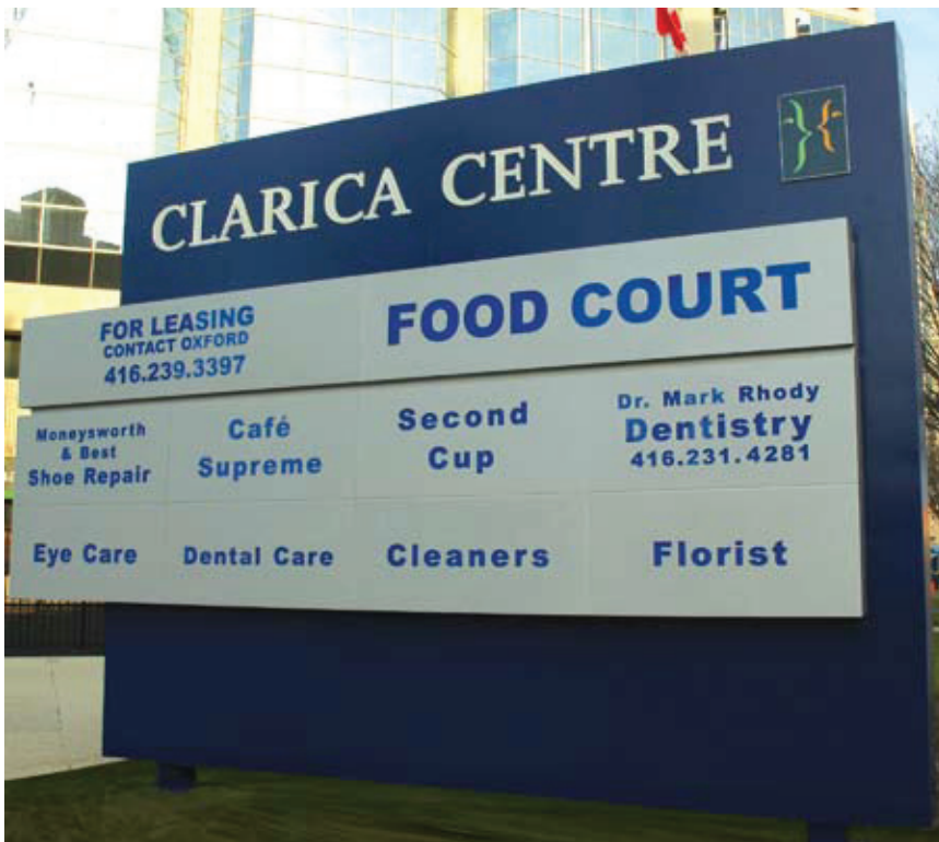
The full sign and directory installed at Clarica Centre