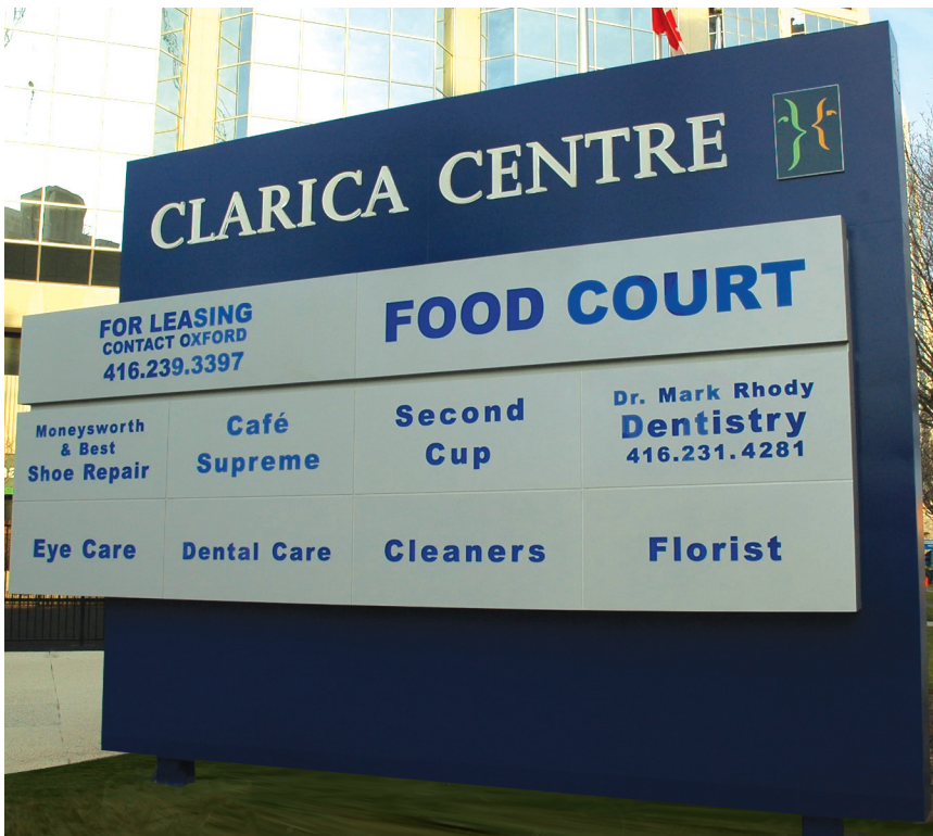
The full sign and directory installed at Clarica Centre