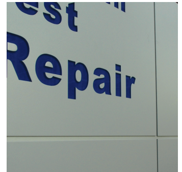
Detail of the incised and infilled acrylic lettering