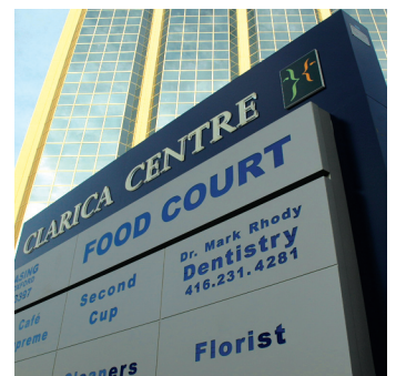
Welded aluminum over steel frame