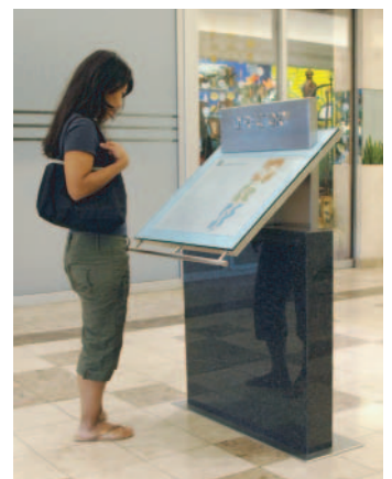
Customer using wayfinding directory