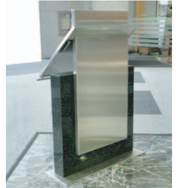
Back of directory featuring brushed st. stl. cladding

Highlights - Directories utilize a welded steel sub-frames, with Nero Impala black granite cladding at the bottoms, stainless steel cladding at the tops, and cantilevered clear glass faces protecting full-color printed maps and tenant information.