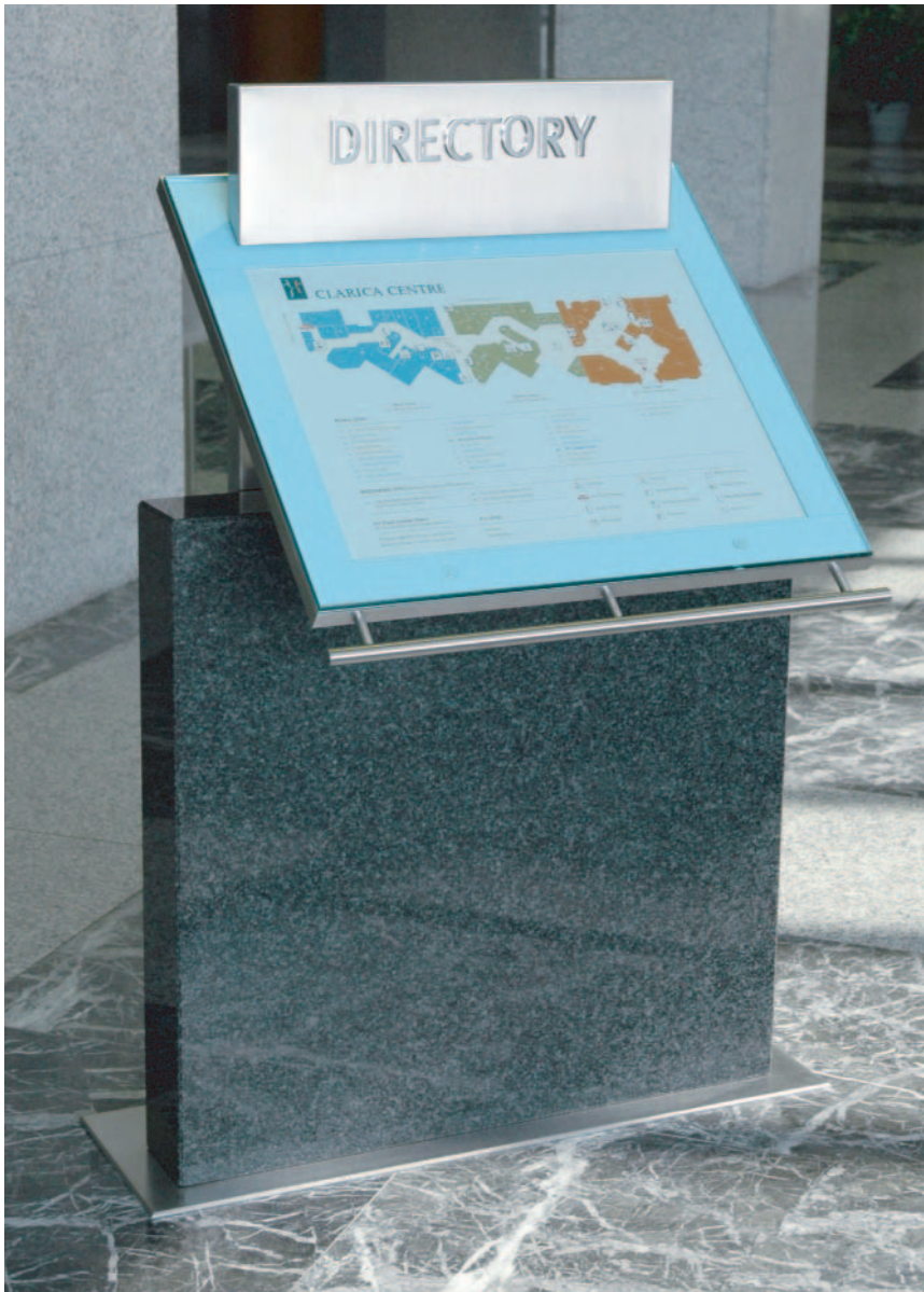
Freestanding directory with st. stl. and Nero Impala black granite cladding as well as cantilevered clear glass face