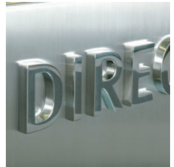
Polished st. stl. lettering on brushed st. stl. cladding