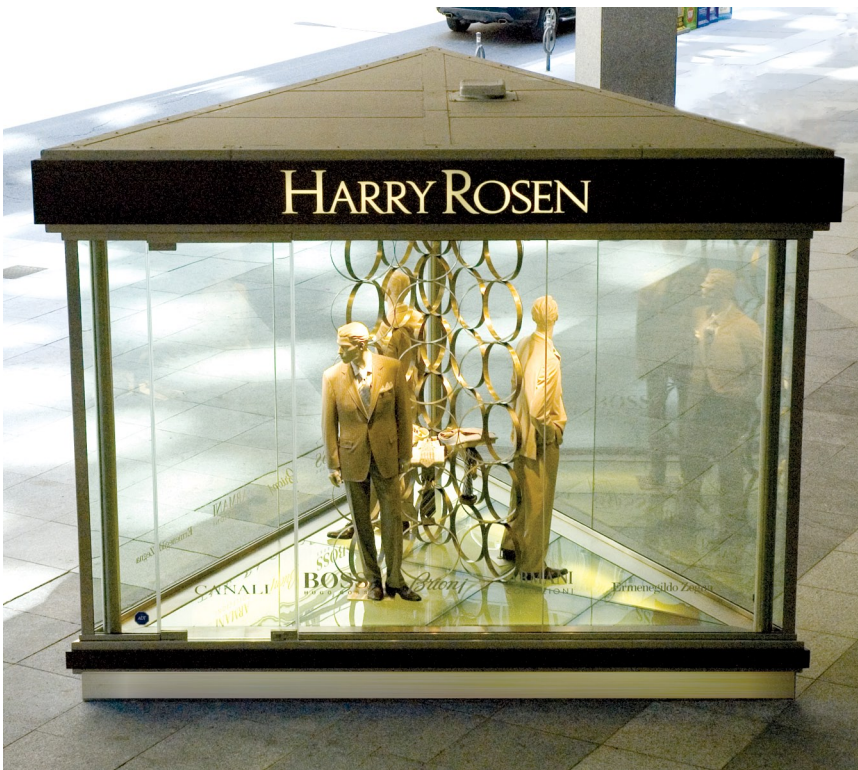
The exterior display case, installed at First Canadian Place