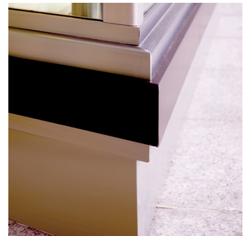
Precision fabrication using different metals