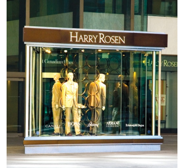
Custom, unique, exterior display case

Highlights - The Exterior Display Case features formed, anodized aluminum band signage and stainless steel corner guards, posts and ceiling panels. Glass walls are 1/2" thick with stainless steel shoes, locking mechanisms and hinges. Glass floor is frosted and tempered and serves to diffuse the light source from below. Ceiling is stainless steel paneling that features directional inset lighting that can be configured to suit the display.