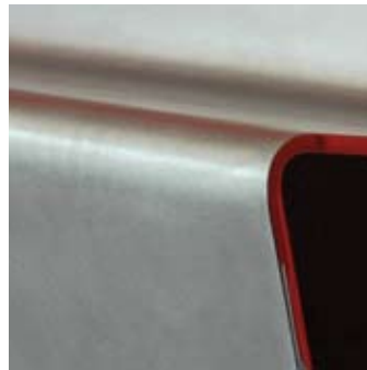
SML's special non-directional orbital finish