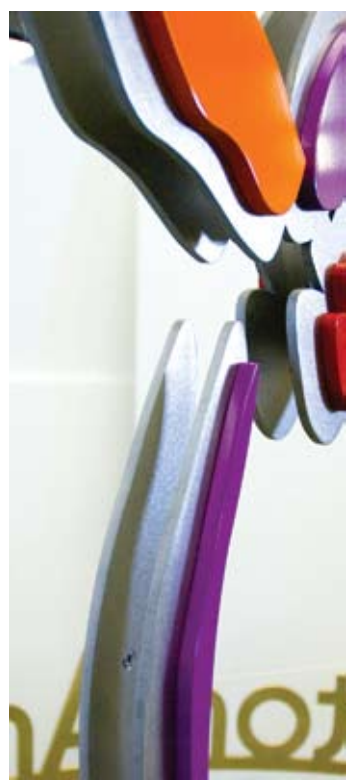
Painted aluminum mounted to stainless steel