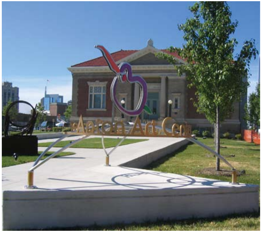
The finished sign, seen here on site, uses (4) different metals and has (4) different finishes.