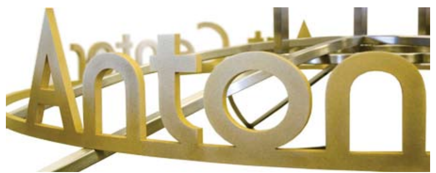
1/2" Waterjet cut bronze graphics mechanically mounted to a tig welded ring.

Highlights - This project required the use of Aluminum, Bronze, Stainless Steel and Brass as well as varied finishes for each of these. The Artist's Palette Sculpture is waterjet cut 1/4" stainless steel with painted 1/4" aluminum elements, each mechanically mounted. The main structure is brushed stainless steel 1" square tubing with steel inserts in brushed brass footings. The ring and type graphics are waterjet cut 1/2" bronze with SML's special non-directional finish. The circular band and graphics are mechanically mounted to the chassis which is a brushed stainless steel square tubing structure forming a trois-foil design.