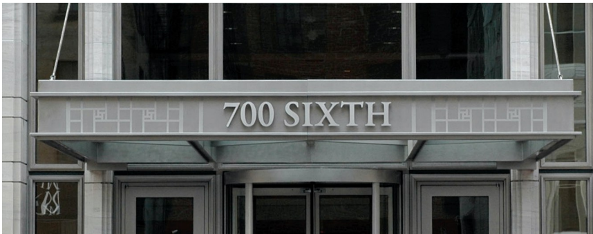
Exterior stainless steel canopy cladding