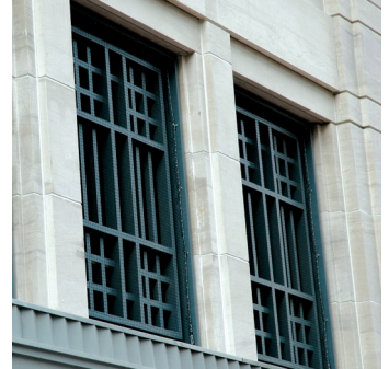
Exterior air intake grilles

Highlights - Canopy cladding is acid etched, patterned stainless steel. The Chinese lantern style custom light fixtures are made with stainless steel and feature SML's (orbital) non-directional finish, with custom tempered glass inserts. Glass is coated with a ceramic frit to provide translucency to the glass. The inset grilles were fabricated from extruded aluminum and painted in a UV stable powder coat finish painted to design specifications. In January 2010, SML was selected the winner of the Washington Building Congress Craftsmanship Award® which recognizes SML's outstanding skill and achievement on its scope of work for the 700 Sixth Street NW project.