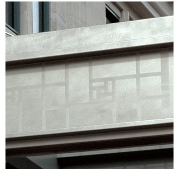
Acid etched pattern detail