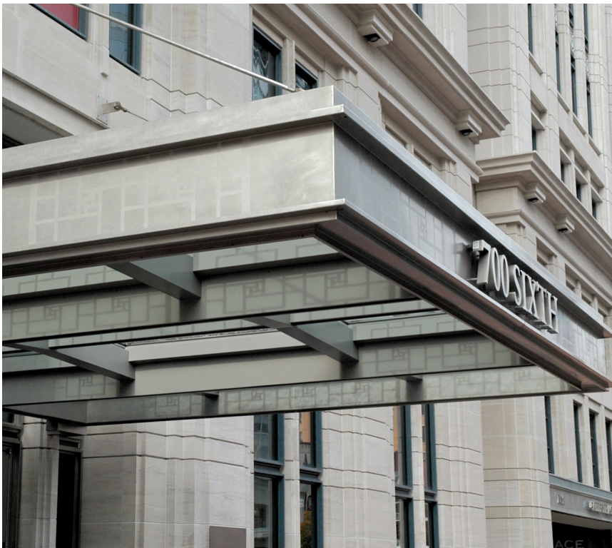
Stainless steel canopy cladding with etched pattern