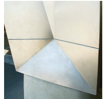
Concave forming of the cladding