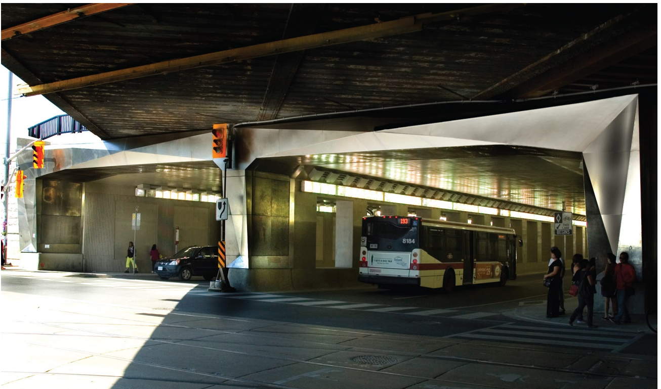
The Dufferin Street Jog portal with stainless steel portal cladding.