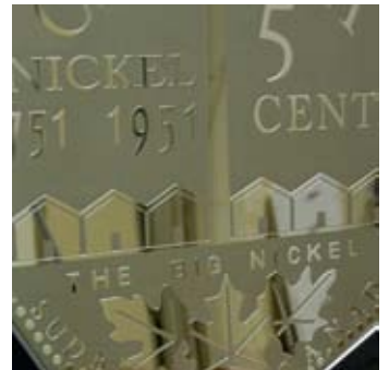
Detail view of high quality etching