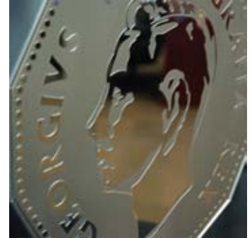
Ultra fine quality etching

Highlights - This Nickel Award features an oversize reproduction of a Canadian five cent piece. The material used is Supreme No.8 mirror finished stainless steel grade T304 of a 22 gauge thickness. The image from the coin was scaled up and etched onto the sheet metal then cut and sent to the Ontario Sheet Metal Workers Training Centre where it then was sent to Sudbury Ontario to be used in a training process whereby the full award was fabricated by trainees as part of the larger project initiative.