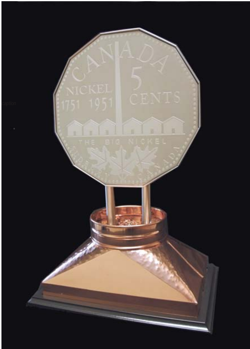
The Ontario Sheet Metal Workers Training Centre - Nickel Award