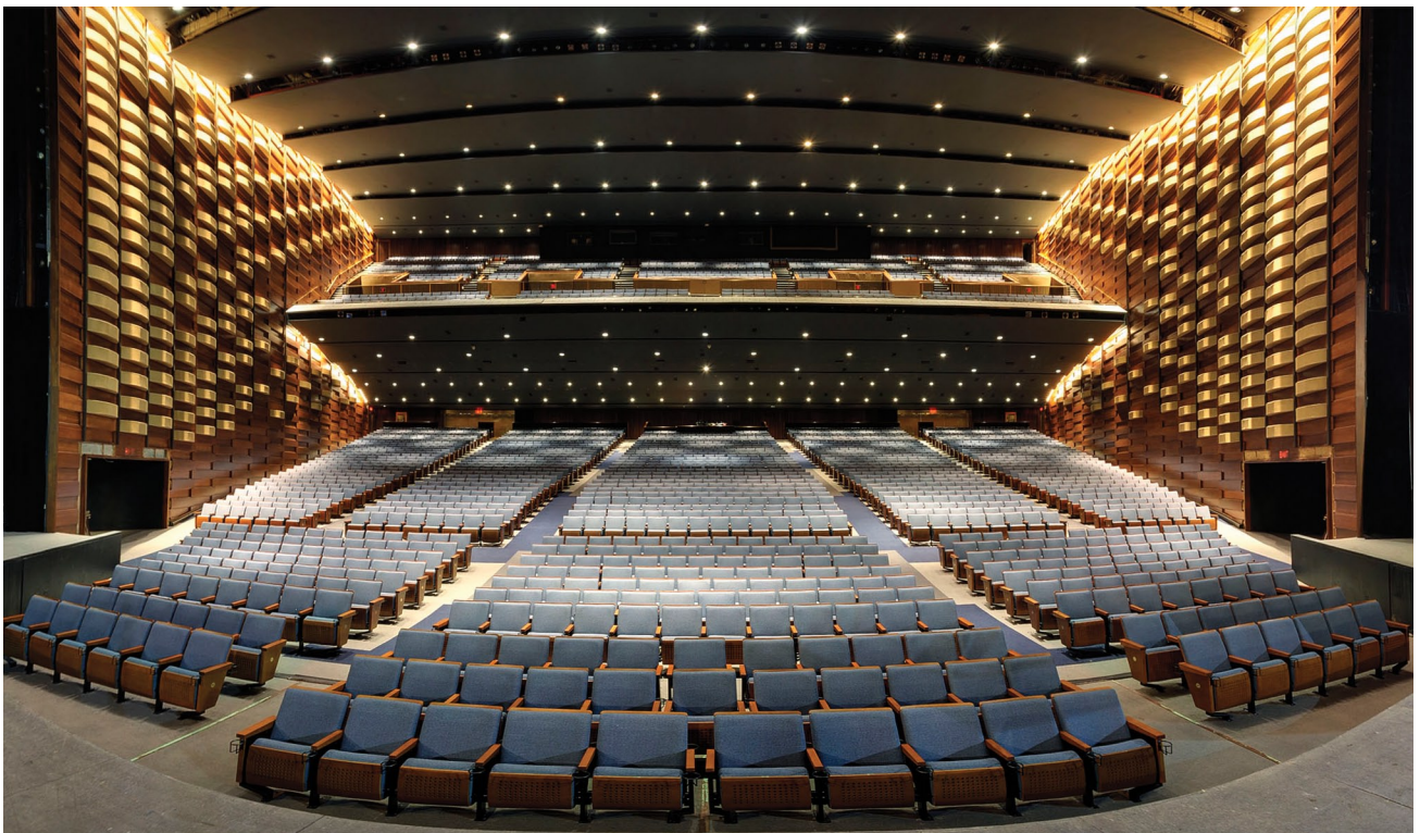
The main theatre of the Sony Centre for the Performing Arts fully restored