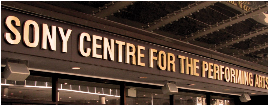
Solid bronze waterjet cut letters above the main theatre entrance