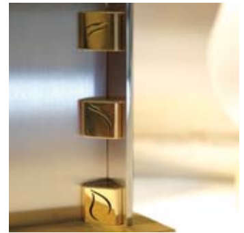
Detail of the rosettes