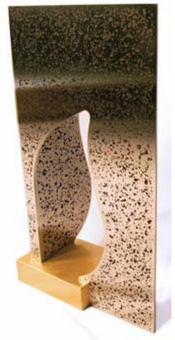
The reverse side of the award