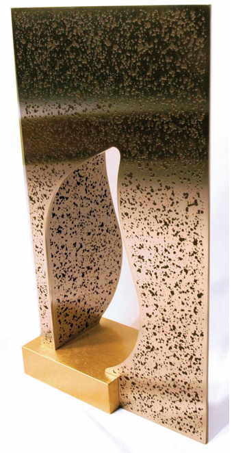
The reverse side of the award