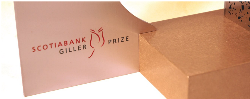
The newly redesigned base and extended flange

Highlights - The Giller prize has been redesigned and now has a lighter and smaller base and an extension to the steel flange. It is waterjet cut brushed and mirror polished stainless steel plate, etched with a repetitive mosaic pattern and affixed with decorative polished bronze rosettes, all mounted on a brushed bronze base.