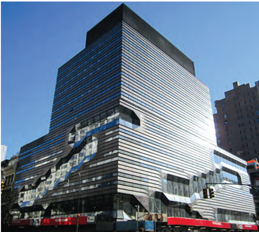
The New School at 65-5th Avenue with completed cladding of the building envelope