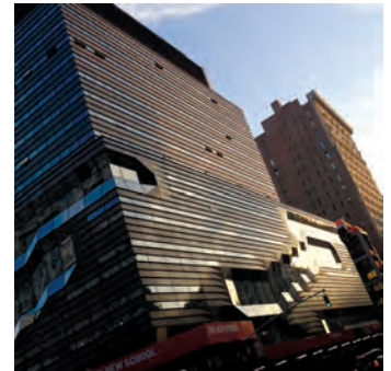
A look at the South side of The New School.