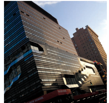
A look at the South side of The New School.