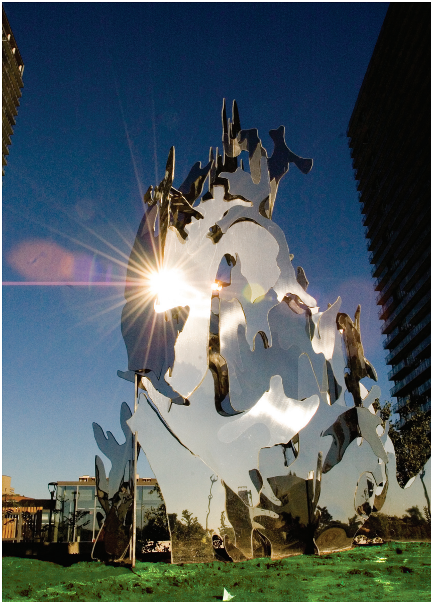
The sculpture in-situ at the NXT condominiums.