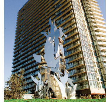
The sculpture viewed from the Highway

Highlights - This sculpture stands approximately 30 feet tall and is approximately 18 feet long and 10 feet wide at the base. The galvanized core of steel is 1/2" to 3/4" inches thick and consists of multiple irregularly shaped parts welded and clad with 16 gauge, 316 alloy stainless steel with a mirror polished finish. The entire sculpture is mounted to a reinforced concrete base complete with structural gusset plates.