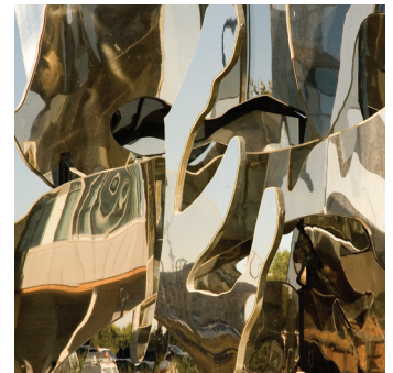
Detail of the plates and cladding