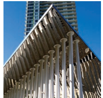
Detail of corner