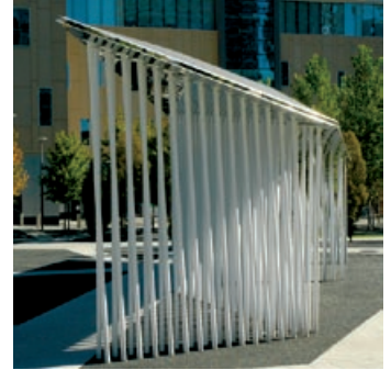
The pavilion viewed from the side

Highlights - This pavilion has a non-rectangular parallelogram shaped roof resting on four channeled braces. Its roof is a robotically welded and galvanized steel framework which is then clad with mirror polished stainless steel. The roof is supported with steel tubing that is powder coated with a titanium white gloss finish which sit within embedded channels in the concrete. There are 182 of these steel tubes in total. The footprint of the structure is 60' long on the north side, 45' long on the south, 15.5' on the east and 12.5' on the west. It stands at 14.5' at it's highest point.