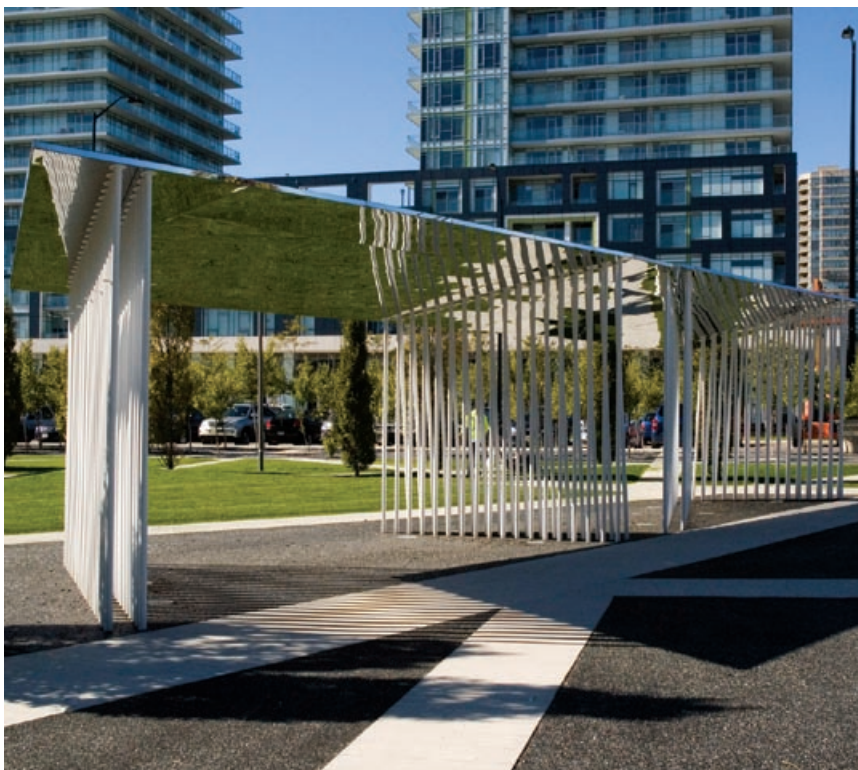
The Scholars Green Pavilion at Sheridan College Mississauga campus.