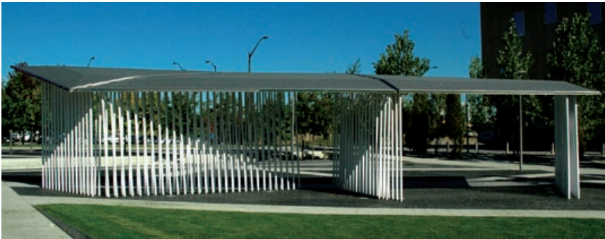
The pavilion as viewed from the rear, facing North