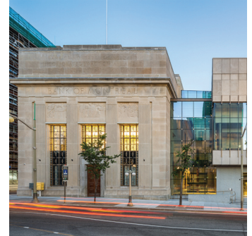
The John A. MacDonald building

Highlights - Monumental bronze staircase with glass balustrades and stone treads mounted to bronze clad stringers with solid bronze railings in the atrium. More bronze railings throughout the building including switch plate covers, grates and floor plates. Speaker columns and benches in main hall on second floor are custom fabricated using architectural bronze mesh, walnut and leather. Patinated column cladding throughout the interior of the building. Door frames of 3/4" solid bronze, custom patinated at the entrances. Bronze patinated inlays to the interior stone walls. Bronze patinated finials and mullions support the glazing for the building envelope.