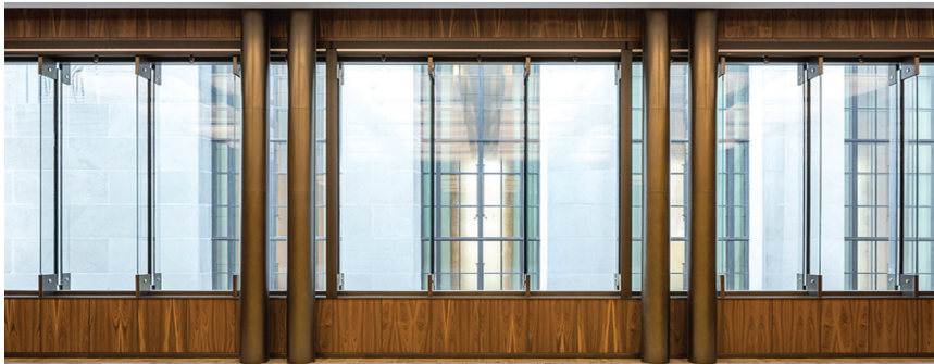
Patinated bronze clad columns