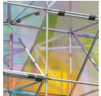
Detail of frame and lenses