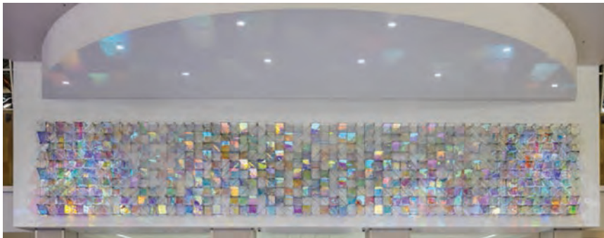
The sculpture beneath the gate canopy