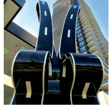
Detail of the traffic line anti graffiti paint

Highlights - Soheil Mosun Limited was contracted to produce this 9.175 metre tall public art installation to be custom made and formed of steel and is based on the artists vision by the in house design manufacturing work at Soheil Mosun Limited. There are nine (9) foundation stools which the sculpture sits upon and these have been treated to be fully weather resistant. The sculpture is painted to represent a highway, with white traffic lines all along the sculpture. The entire sculpture has been covered in anti graffiti coating.