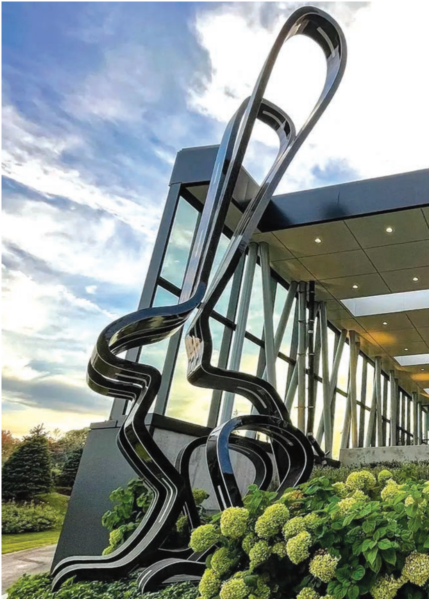
The Rabbit as viewed facing South at the entrance to Block 12 of Concord Park Place