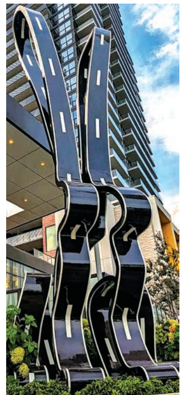
The Rabbit as viewed at the entranceway